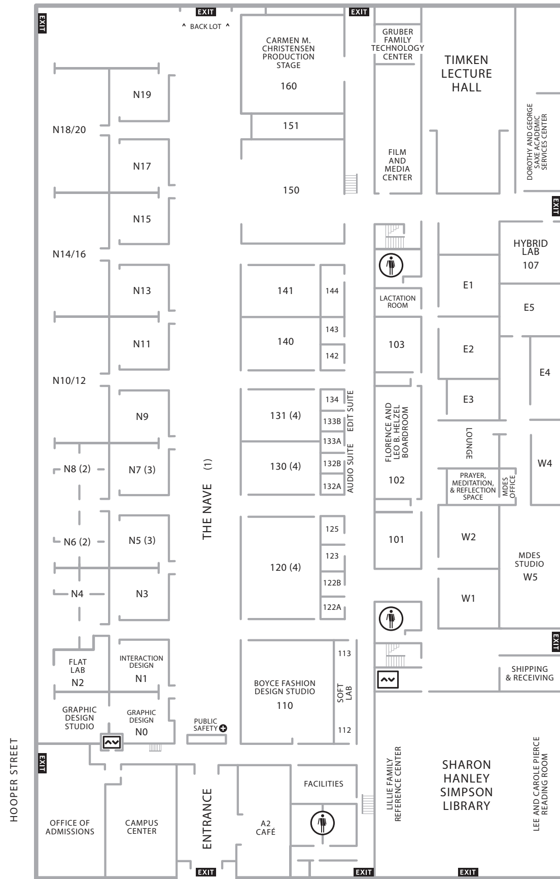
FIRST FLOOR EIGHTH STREET